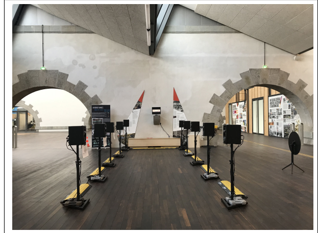
Figure 2. Immersive sound installation “Hydrofaunie” during the Arts & Sciences Ressac Festival (Brest, 2022).

“Under the Sea” was an immersive audiovisual installation designed by Master Students in Sciences & Tech-