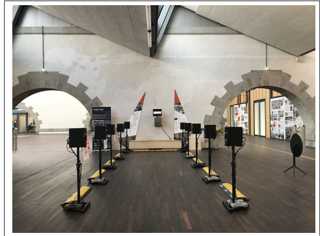
Figure 2. Immersive sound installation “Hydrofaunie” during the Arts & Sciences Ressac Festival (Brest, 2022).

“Under the Sea” was an immersive audiovisual installation designed by Master Students in Sciences & Tech-