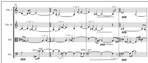
Figure 4. String quartet “Picogramme”

In their study on sonification of salmon migration, Hegg et al. explain that they had worked with composers “with the objective of meaningfully representing juvenile salmon movement as sound [...] in a pleasing way” [11]. As one of the researcher of our project was also a professional composer, he tried to explore several ways of transforming the echograms into “meaningful” (and hopefully pleasing) music. Depth, intensity and colour of the echogram presented in Fig. 1 were mapped to musical parameters such as pitch, dynamic, rhythm or timber, resulting in a 7-minute string quartet, “Picogramme”, which was created during the 2023 RESSAC meetings (see Fig. 4).