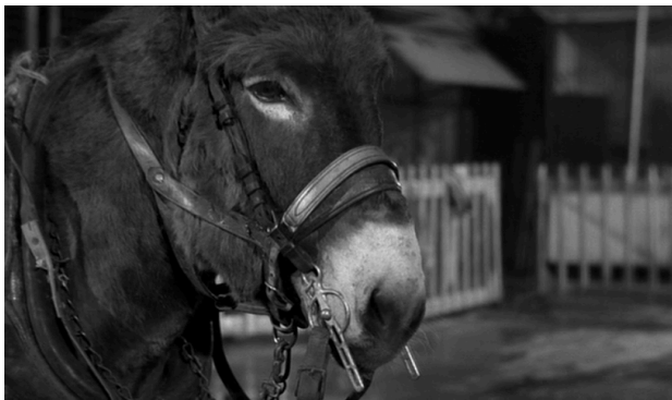
Fig. 1: Balthazar looks at the circus animals.

exchange of looks starts with the circus worker's leaving the frame as we hear roaring of a tiger. Balthazar diverts his eyes slightly (fig. 1), and the scene cuts to a tiger, lying on his belly in an iron cage, with chains dangling in the air (fig. 2). The shadows of the iron bars dissolve and merge with his beautiful furry stripes. One of the iron bars blocks exactly his left eye. He looks at Balthazar, paws in front, mouth slightly open, sits absolutely still save the breathing motion in the chest. The shot/reverse-shot is repeated and this exchange between them is shown to us twice. Similarly, Balthazar looks at a polar bear (fig. 3), an ape, an elephant, in their respective cages, silent or raucous. But only the first two exchanges have two reverse-shots while the last two were given one reverse-shot. What marks the difference between the last two and the first? What type of progression is suggested by this subtle numerical change?