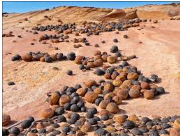
Moki Hill – HITTR, Grand Staircase.

In the language of the literature, it doesn't: they are called "Martian blueberries" (sometimes with, sometimes without the scare quotes). This expresses some aspect of what we are inclined to say. They look like blueberries, and (at the same time), they are not what we would ordinarily call blueberries. Ironically, the familiar word keeps the object alien while allowing us to speak about it. Now consider the implications of calling them marbles. Now in a certain sense marble could fit. But it would also generate confusions: marble already exists as a semi-technical term for certain terrestrial things. Below are moqui marbles, round hematite balls found in the Utah desert: