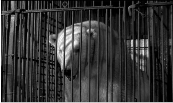
Fig. 3: Second exchange – polar bear.

the first two exchanges have been possibly replaced by a point-of-view shot of Balthazar. Before, we assume and understand that Balthazar and the circus animals are looking at each other; now, we view the scene as Balthazar views it.