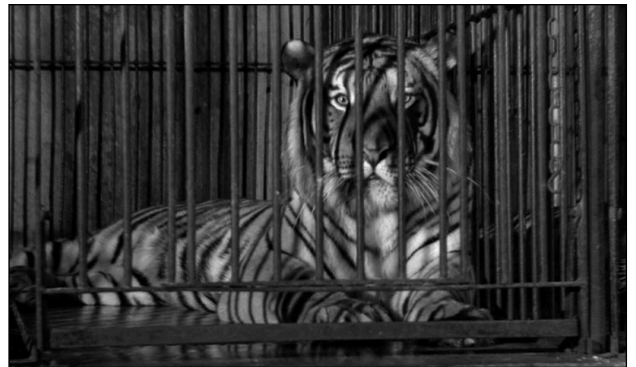
Fig. 2: First exchange – tiger.

“There is a logic here, but what is it?” Brian Price in his analysis continues to observe about the ordering and structure of the shots, “What might be passing through that structure is a recognition: the coming together of beings united in suffering.” 83 How the recognition is arrived at and how this togetherness is portrayed are of the utmost importance. When we get to the ape (in the third exchange) — the only animal in the sequence that makes sounds upon seeing Balthazar — we see the dangling chain foregrounded. This highlights a double imprisonment since he is already within the cage — as if his expressiveness is a threat, his likeness to us a menace. This exchange contains a quick and subtle gesture: the ape looks directly into the camera, however briefly (fig. 4). We realize the conventional shot/reverse-shots established in