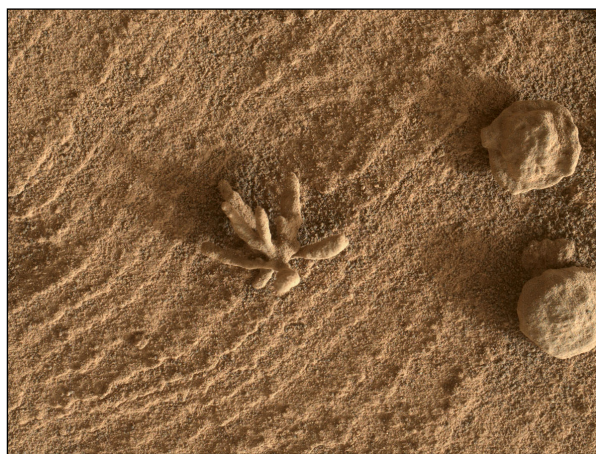
Nasa Curiosity Rover Photo.

Let us take our words on such a journey. This picture was taken on Feb. 24, 2022 by the Mars Curiosity Rover: