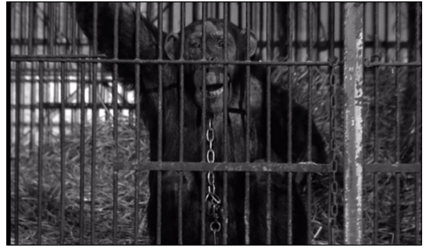
Fig. 4: Third exchange – ape looking into the camera.

The last exchange confirms the subtle but mysterious shift in perception and remains the most striking. If this were taken as a shot/reverse-shot, it would have broken the 180-rule — we see indeed both Balthazar's and the elephant's left eye (fig. 5 and 6). Both the camera position and the fact that the elephant looks directly into the camera suggests that, again, we are taking up Balthazar's point-of-view. The ape's expressiveness is replaced with complete silence on the elephant's part; its indecipherability is absolute. It is the most extreme close-up so far — for both Balthazar and the elephant. In fact, what we have are two eyes, tout court . The close-up of the elephant's eye, with its surrounding area, looks like a wrinkled old human's eye: a circus animal now appears almost indistinguishable from us. Its head fills up almost the entirety of the frame; no trace of its imprisonment is visible on the screen.