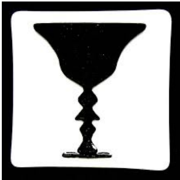
Fig. 2: Chalice/Profiles.

To see an aspect is not to place an interpretation on an object: "But how is it possible to see an object according to an interpretation ?" (PPF, §164). Discussing the example of the chalice/two profiles illusion, Jan Zwicky explains why seeing an aspect isn't an interpretation: "It makes no sense to say one is more basic than the other, nor to say that the drawing is "really" just splotches of paint that we can "interpret" as we choose." 34