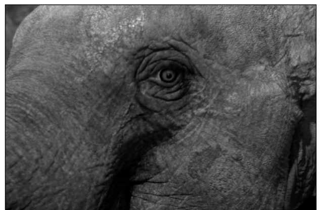
Fig. 6: Fourth exchange – Close-up on the elephant's left eye.