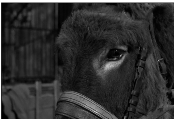
Fig. 5: Fourth exchange – Close-up on Balthazar's left eye.

The last exchange confirms the subtle but mysterious shift in perception and remains the most striking. If this were taken as a shot/reverse-shot, it would have broken the 180-rule — we see indeed both Balthazar's and the elephant's left eye (fig. 5 and 6). Both the camera position and the fact that the elephant looks directly into the camera suggests that, again, we are taking up Balthazar's point-of-view. The ape's expressiveness is replaced with complete silence on the elephant's part; its indecipherability is absolute. It is the most extreme close-up so far — for both Balthazar and the elephant. In fact, what we have are two eyes, tout court . The close-up of the elephant's eye, with its surrounding area, looks like a wrinkled old human's eye: a circus animal now appears almost indistinguishable from us. Its head fills up almost the entirety of the frame; no trace of its imprisonment is visible on the screen.