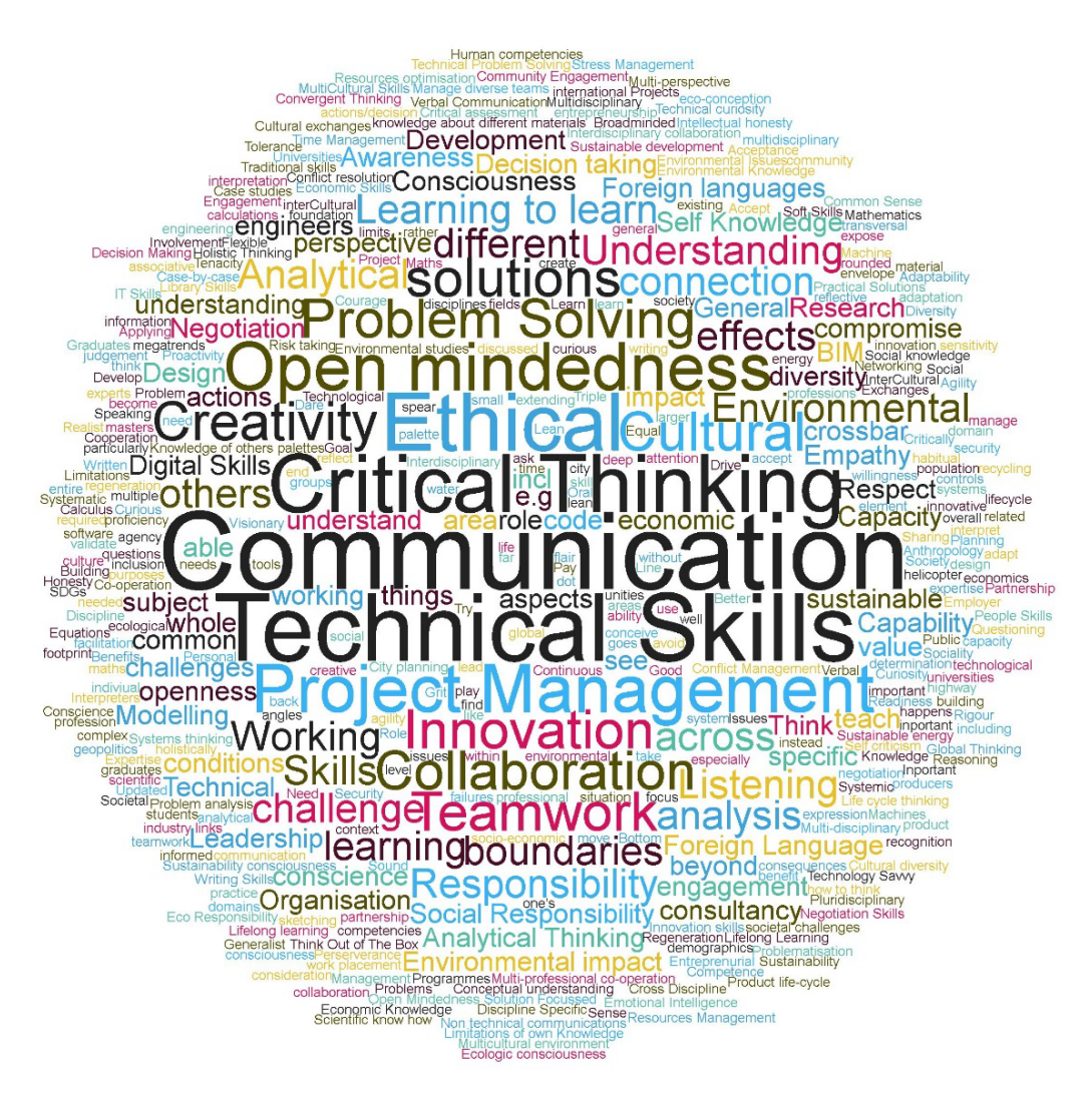
Figure 2: Overall word cloud indicating skills requirements for Engineers to achieve the SDGs [All groups, All countries]

The focus groups were tasked with a brainstorming session which identified a list of skills required to achieve the SDGs. Figure 2 shows the word cloud and list of most frequently used phrases associated with all participant groups and all countries. Further details of skills requirements differentiated by each particular group and country are available in Beagon et al., (2019).