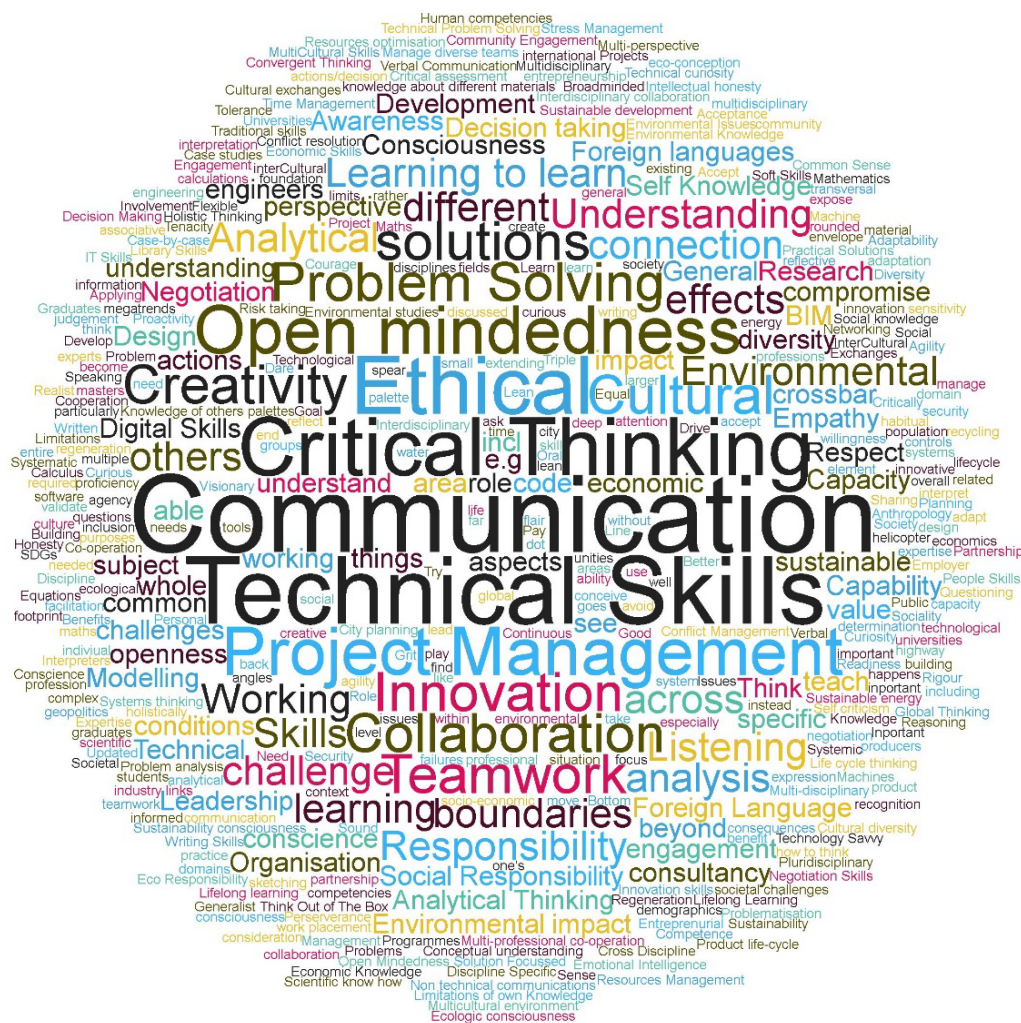
Figure 2: Overall word cloud indicating skills requirements for Engineers to achieve the SDGs [All groups, All countries]

The focus groups were tasked with a brainstorming session which identified a list of skills required to achieve the SDGs. Figure 2 shows the word cloud and list of most frequently used phrases associated with all participant groups and all countries. Further details of skills requirements differentiated by each particular group and country are available in Beagon et al., (2019).