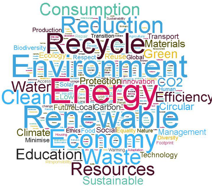
Figure 1: Word cloud showing all words and themes associated with Sustainable Development [All countries, All groups]

The results for each participant group were also analysed to contrast and compare different groups. Figures 2-4 shows the individual word clouds associated with Sustainable Development with each participating stakeholder group.