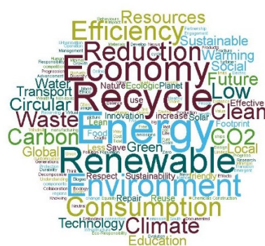
Fig. 3. Employers– themes associated with SD