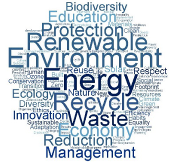
Fig 4. Students– themes associated with SD

The overall results of the word frequency exercise presented here suggest that “Energy”(65) is the key theme associated with Sustainable Development, clearly out in front and followed by “Environment”(30), “Renewable”(30) and “Recycle”(28). These key words align very clearly to the pillar of Environment. “Economy”(26), “Resources”(17) and “Circular”(10) are the most mentioned words associated with the pillar of Economy. Words associated with the third pillar, Society, are sparse, with only “Education”(14) and to a lesser extent “Diversity”(5) and “Equality”(5) being included within this pillar, but with only five mentions each.