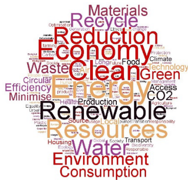
Fig. 2. Academics – themes associated with SD