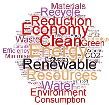
Fig. 2. Academics – themes associated with SD