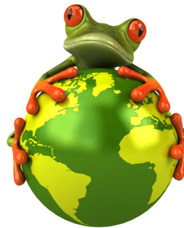
Figure 6: the frog used in communication documents of the collective ‘ RGE... pas comme ça! ’

Another interesting feature of the collective’s communication action was its graphic embodiment. They devised a logo parodying the original label sign, where the name ‘ Garant ’ was replaced by ‘ Grenouille ’, and where a question mark appeared in the end, with a small frog hanging on the planet figuring the dot. 13 The image of the frog, represented in various posture (feverishly, conducting inquiry with a magnifying glass, in the position of making a testimony, etc) was used in other communication documents distributed by the collective, symbolising the fragility of the small entrepreneurs joggled by the RGE policy (Figure 6).