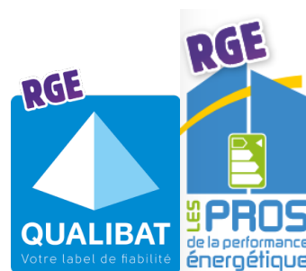
Figure 4: Affixing RGE on various quality labels