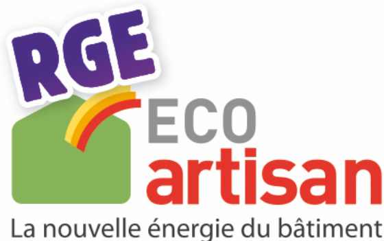
Figure 2: The ‘RGE-labelled’ ECO-Artisan label

An important dimension of the messaging process is the concrete modalities through which the message is expressed in market scenes. How is the sign affixed to the labelled entity? The promoters of the RGE policy had to invent an original modality of ‘visual messaging’ adapted to the idea of ‘labelling a label’. They devised a graphic language where the logo of ‘RGE’ was affixed on the logo of the label, conventionally tilted at the top and on the left. Figure 2 illustrates this method, on the case a well-known label in the construction sector, the ‘ECO-artisan’ label. Here, we see concretely an expression of the ‘cascade’ of labelling that was at stake in the RGE policy. We also get an intuition of a reason why the acronym version of the label was so important: the idea of labelling a label could be readable only if the logo was compact enough.