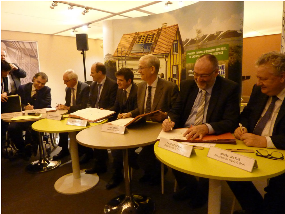
Figure 3: the ratification of the RGE agreement

It is interesting to note that the logo of RGE does not use the codes that traditionally characterize logos and other elements of visual identity of the French administration: neither the figure of Mariane , the emblem of the French republic (Agulhon, 1979), nor the blue-white-red colours appear, explicitly or as a connotation, in the RGE graphic image. Alauzen (2019) has studied the genesis of a logo for a French administration in charge of developing relations with citizen on the Internet. Her work shows the importance of these visual stereotypes for the incarnation of State as an actant in various political and economic contexts. Although we do not know the detail of the genesis of the name and the logo of RGE, we may assume that the intent here was less to signify the presence of the State in the market, than the presence of the specific State-led coalition we have described.