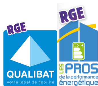
Figure 4: Affixing RGE on various quality labels