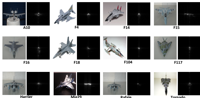
Fig. 2. Description of ISAR images database composed by twelve classes (aircraft targets). Beside each ISAR image, we display its ground truth.

In order to assess the performance of the proposed approach, we use ISAR images database. These radar images are acquired in an anechoic chamber using twelve reduced-scale (1/48) aircrafts (classes): Rafale, Harrier, F104, Tornado, A10, F117, F16, MIG29, F14, F18, F4 and F15. Each class is composed by 162 ISAR images of 256 \times 256 grayscale pixels. To reconstruct them, the inverse fast Fourier transform (IFFT) method [1] is adopted. Examples of the ISAR images contained in this database as well as its ground truth are illustrated in Figure 2.